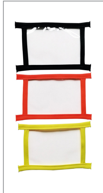
Yellow, Orange and Black Chest W = 10,5 cm x H = 7,5 cm